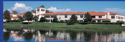
FOREVER LIVING CORPORATE PLAZA